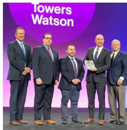
Trevcon Construction leadership accepts the award at the 2019 AGC of America National Convention.

ACCNJ member Trevcon Construction placed second in the Construction Safety Excellence Awards Heavy Civil 300,000-500,000 hours category at the Associated General Contractors of America National Convention. Congratulations on this outstanding accomplishment!